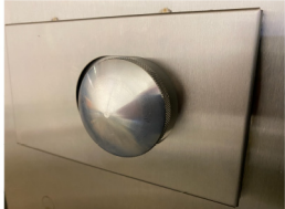
Emergency Release Mechanism

Hamilton Fire Door delivers maximum security with architectural appeal. Available in UL-Listed Class M, Hamilton's door is tough, reliable and loaded with many features. The Door is engineered to provide superior protection against forced entry and fire. Using a Hybrid frame and door made up of steel and high strength concrete barrier. This is a great option for commercial industry, cannabis and residential storm shelter.