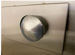
Emergency Release Mechanism

Hamilton Fire Door delivers maximum security with architectural appeal. Available in UL-Listed Class M, Hamilton's door is tough, reliable and loaded with many features. The Door is engineered to provide superior protection against forced entry and fire. Using a Hybrid frame and door made up of steel and high strength concrete barrier. This is a great option for commercial industry, cannabis and residential storm shelter.