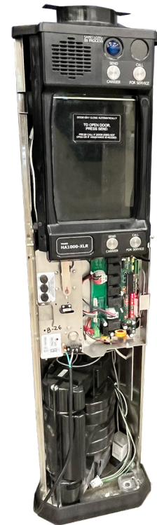
An inside look at a HA1000-XLR unit with the UVC Light Kit