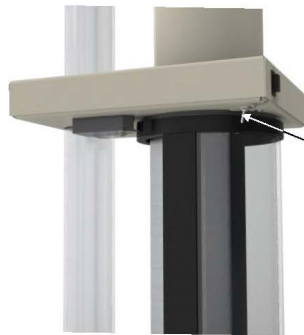
Night Lock Switch