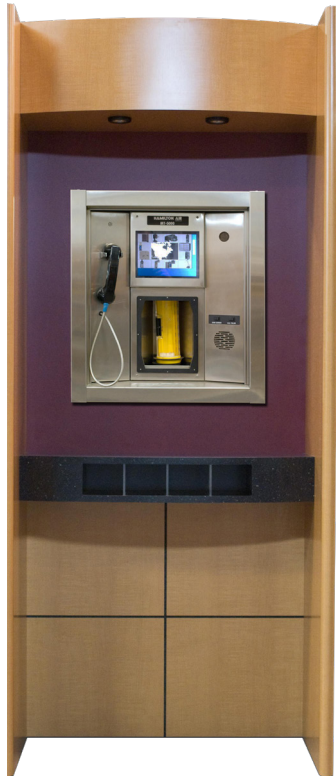
An IRT-5000 within a custom kiosk