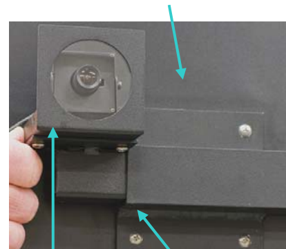
Drill Hole Here