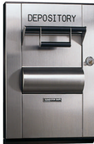
Model: Hamilton – 98RH