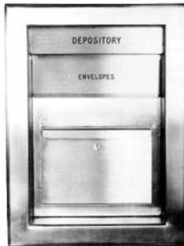
Model: Hamilton Safe – 67R Replace with: 98RH Kit: N/A Instructions: N/A