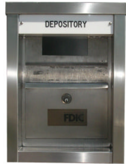
Model: National – Recessed Replace with: 98RH Kit: N/A Instructions: N/A