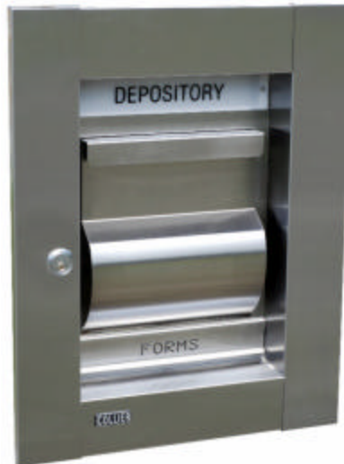
Model: Collier – ND2000 / ND2010 Replace with: 80UC Kit: 96-475 Instructions: N/A