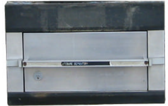
Model: Lefebure – 312 Replace with: N/A Kit: N/A Instructions: N/A