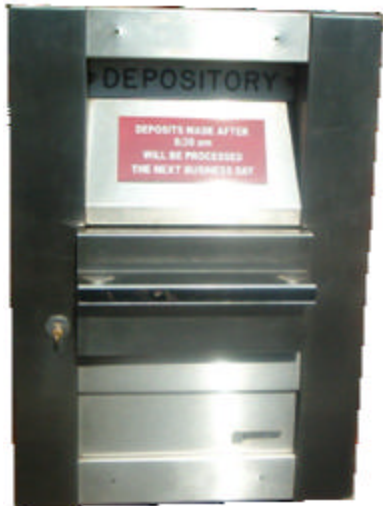
Model: Collier – ND1000 Replace with: 98RH Kit: 96-449 Instructions: N/A