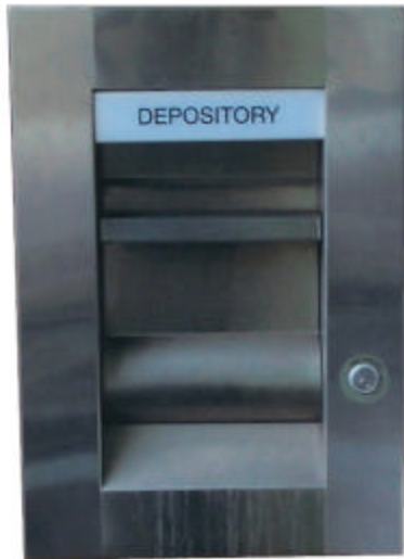
Model: Lefebure – 412 Replace with: 80UC Kit: B6883 Instructions: N/A