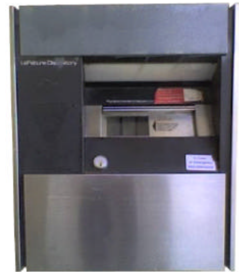
Model: Lefebure – 612 Replace with: 98RH Kit: B6357 Instructions: Doc #08-327