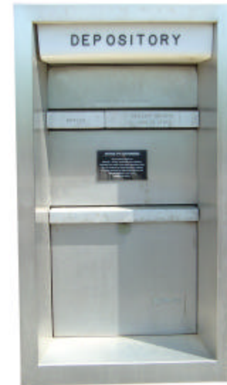
Model: Mosler – C77-DR Replace with: 98RH Kit: B6394 Instructions: Doc #08-330