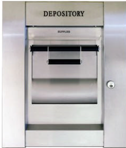
Model: Fortis – AHD-106 Replace with: 80UC Kit: N/A Instructions: N/A