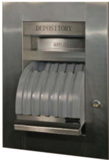
Model: Diebold – Cashgard Replace with: 80UC Kit: B6883 Instructions: N/A