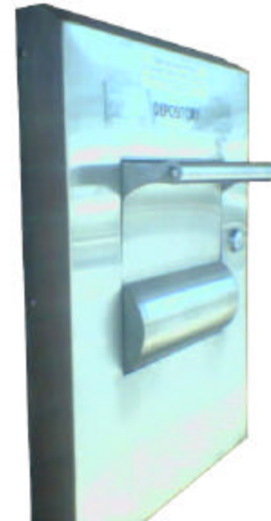
Model: SSE – Replacement Head Replace with: N/A Kit: N/A Instructions: N/A