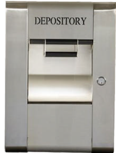
Model: Fortis – AHDR-509 Replace with: 98RH Kit: N/A Instructions: N/A