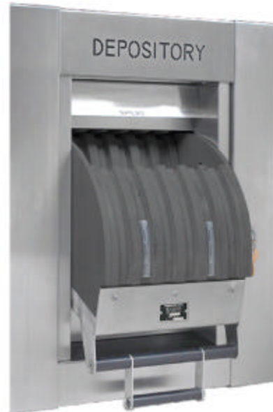
Model: Hamilton – 80UC