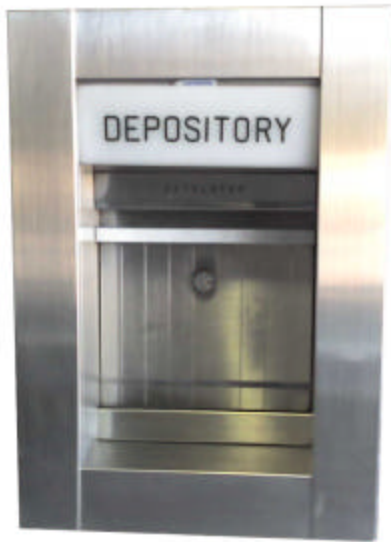
Model: Security Corporation – ND-11 Replace with: 98RH Kit: 96-448 Instructions: N/A