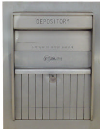
Model: Mosler – Century Replace with: 98RH Kit: 96-470 Instructions: Doc #08-331