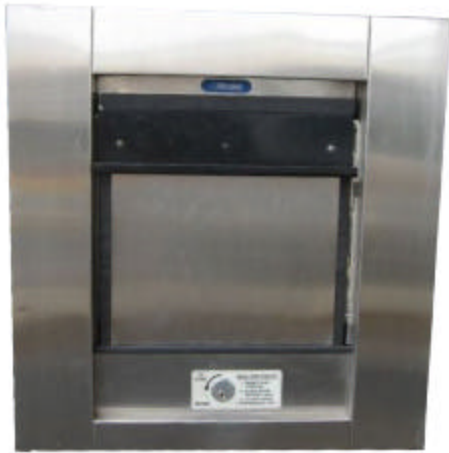
Model: Mosler – Universal Replace with: N/A Kit: N/A Instructions: N/A