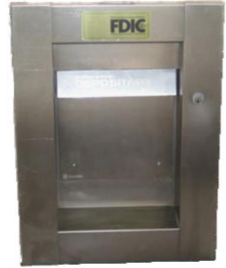
Model: Chubb / Diebold – Citadel Replace with: 80UC Kit: N/A Instructions: N/A