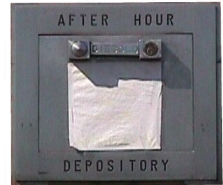
Model: Diebold – Eagle Bag Only Replace with: 98RH Kit: NONE NEEDED Instructions: N/A