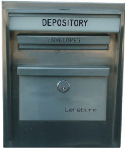
Model: Lefebure – 101 Replace with: 98RH Kit: N/A Instructions: N/A