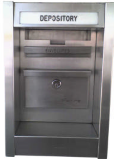
Model: Lefebure – 201 Replace with: 98RH Kit: N/A Instructions: N/A