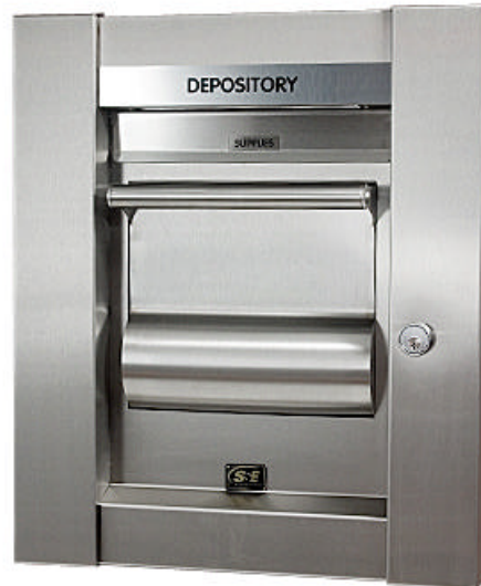
Model: SSE Replace with: 80UC Kit: N/A Instructions: N/A