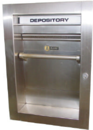
Model: Allied – Nightwatch Dual Replace with: 98RH Kit: 96-440 Instructions: N/A