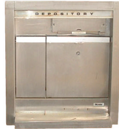
Model: Mosler – Magna Dual Replace with: 80UC Kit: 96-450 Instructions: N/A