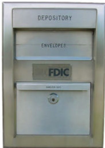
Model: Hamilton Safe – 68F Replace with: 98RH Kit: N/A Instructions: N/A