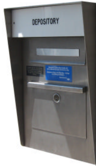
Model: National – Flush Replace with: 98RH Kit: N/A Instructions: N/A