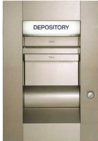
Model: American Vault – Model 85 Replace with: 80UC Kit: B6883 Instructions: N/A