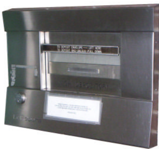
Model: Lefebure – 577 Replace with: N/A Kit: N/A Instructions: N/A