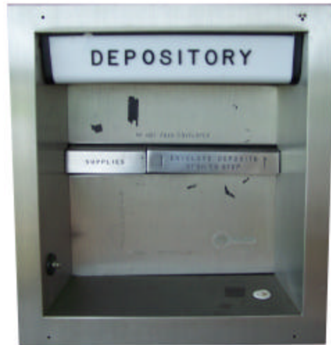
Model: Mosler – C77-ER Replace with: N/A Kit: N/A Instructions: N/A