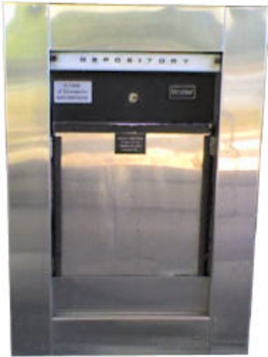
Model: Mosler – American Replace with: 98RH Kit: B6379 Instructions: Doc #08-328