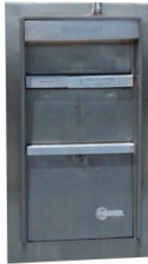
Model: Mosler – C77-DF Replace with: 98RH Kit: B6387 Instructions: Doc #08-329