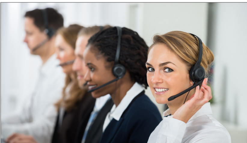
US BASED CUSTOMER CARE CENTER

Call our Customer Care Center or directly to one of our Channel Partners across the country for service on any brand of equipment