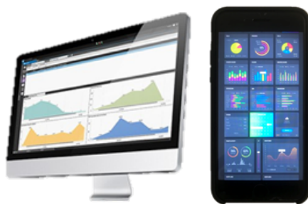
TRACK OUR PERFORMANCE