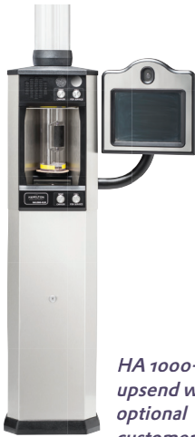
HA 1000-XLR upsend with optional customer video