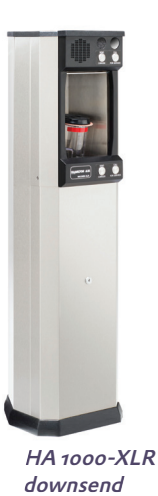
HA 1000-XLR downsend