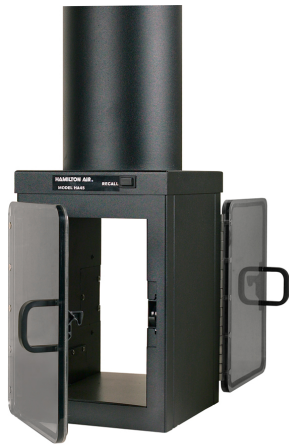
Old grabber latch design