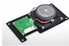
Audio replacement assy. VAT21. Full assy w/ mount plate, speaker and interconnect PCB.