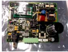
PCB, CCA,CCTV, DSPLY,PWR CONV