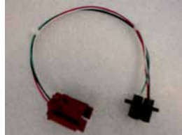
Assembly, Sensor, Door, VAT 23