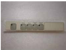
Keypad, Operator Control Panel, VAT 23, 30/EA 10, Upsend