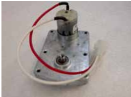
Motor, Door w/ Cable Assembly