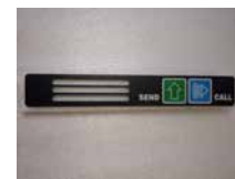
Keypad, Customer Control Panel, VAT 21, 23, 30/EA 10 New Style. Rev D & others