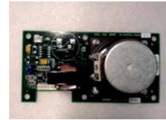
PCB, CCA MIC SPKR