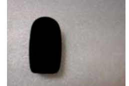
MICROPHONE, WINDSCREEN CHARCOAL