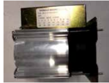
Heater Assembly, 115v, 450W