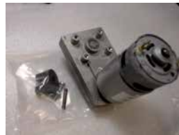
VAT 30 Turntable Motor Kit, Round Motor Shaft and Coupling