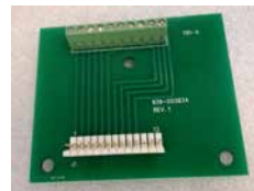
PCB, Interconnect Bd. VAT 21