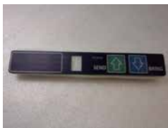
Keypad, Operator Control Panel, VAT 21, New Style