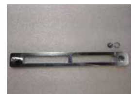
VAT-23 Door Bar Kit