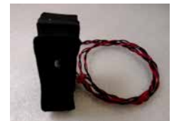
Assembly, Microphone VAT, Rev A & others