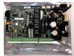
CCA, VAT23, CNTRL, UPSEND