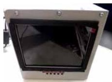
VAT CRT Replacement Display