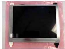
Assembly, 2-Way CCTV, Teller Unit, Replacement Display