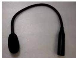
Assembly, Microphone 816 Teller Console