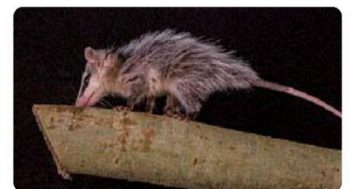
For Ecology Observation*