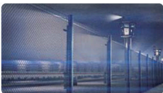
For Safety Surveillance*

Ikegami's ISD-2500HD Ultra-low Light Camera comes with various choices of lenses to choose from and a variety of housings including an exterior IP66 with integral PTZ as to fit the requirements for the tasks it will undertake.