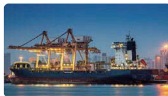
For Port Surveillance*