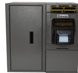
Deposit D12 with optional sidecar and pedestal base