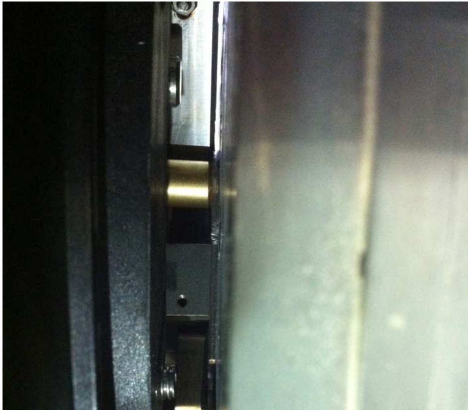
VIEW OF SPACER AFTER INSTALLATION (SPACER WILL NOT ALLOW BRONZE BUSHING TO WORK OUT OF BUCKET)