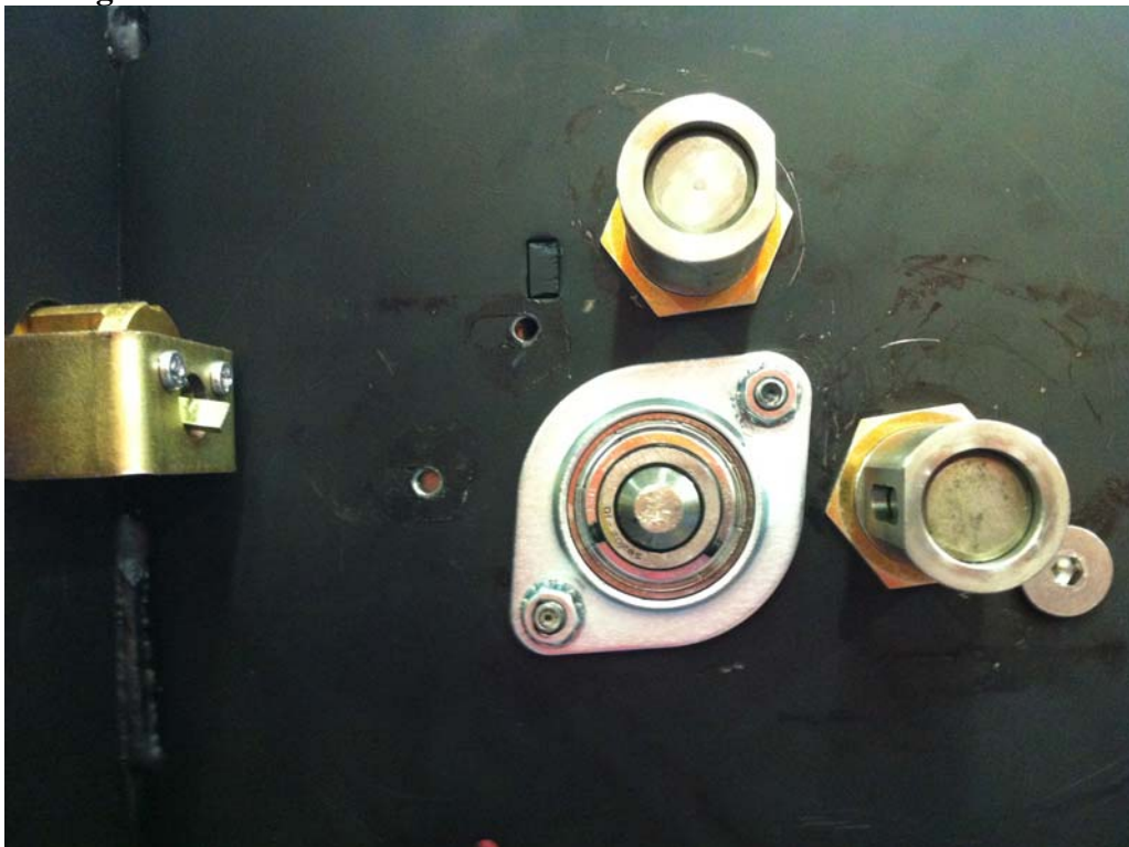
REINSTALLED BEARING AND PIN ASSEMBLY