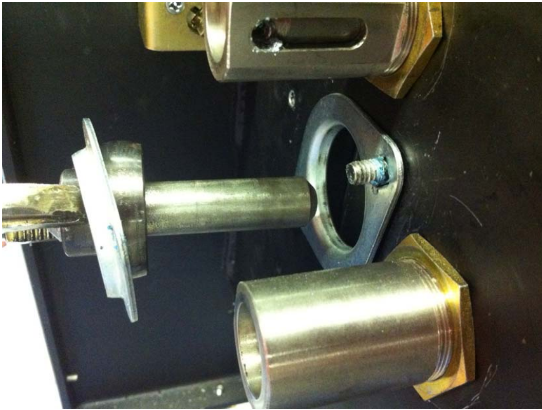
BEARING AND AXLE PIN ASSEMBLY